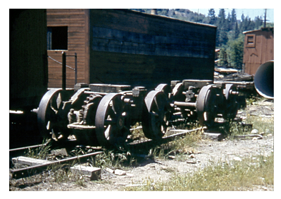
This is a close up of the two Heisler trucks. The tires had been removed and were piled elsewhere.

through the yards of the West Side Lumber Company. I only had with me a new but very small 16mm still camera that would fit in my pocket. It was loaded with Kodachrome (film speed of 10) so 16mm slides resulted. All photos in this Requiem were taken with this camera in about an hour's time.