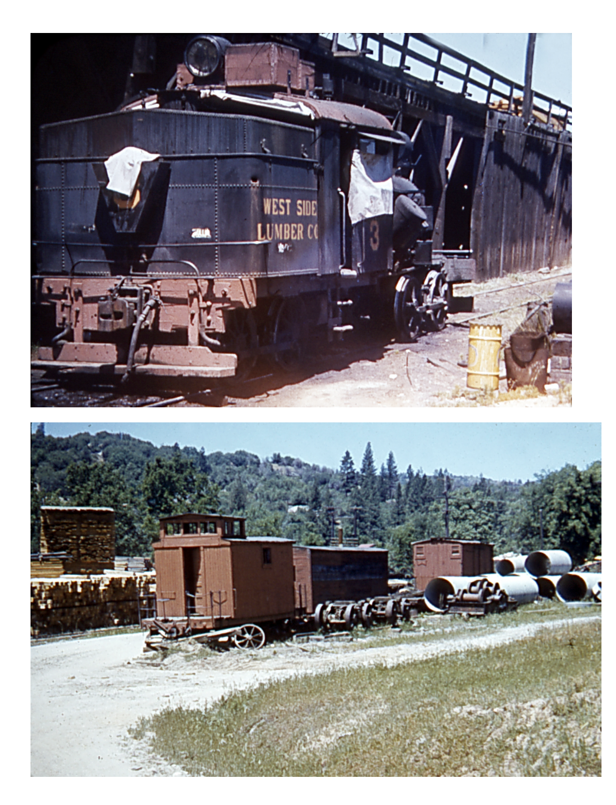
I then found a back entrance road and drove to remote place where I could photograph more of the narrow gauge equipment through a gate.

I learned later that this was Hay Siding and that the two Heisler trucks came from otherwise scrapped Heisler no 4. They just as easily could have been from no 3, which had been converted to standard gauge in 1947 for switching the mill tracks. The caboose had no visible number on it; the car behind the trucks was a round roof camp car (no visible numbers); a flat car with old wire rope coiled on it was next; and the farthest car was what the West Side called a "reefer"