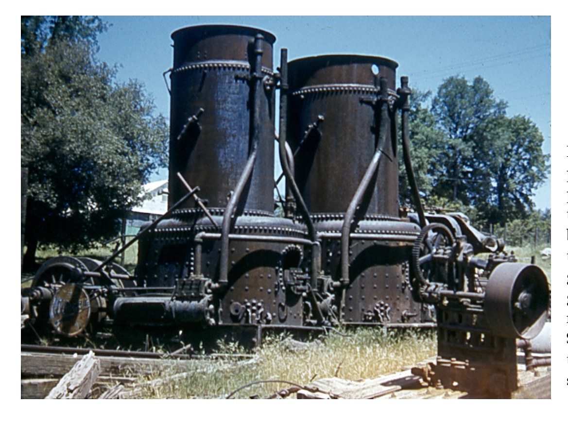
I moved on, taking photos where possible but trying to be inconspicuous because I thought there might be guards on the grounds. Somewhere near the cars on Hay Siding were these two yarders in storage.